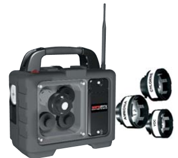
SAFEMTX Multi-Threat Detector